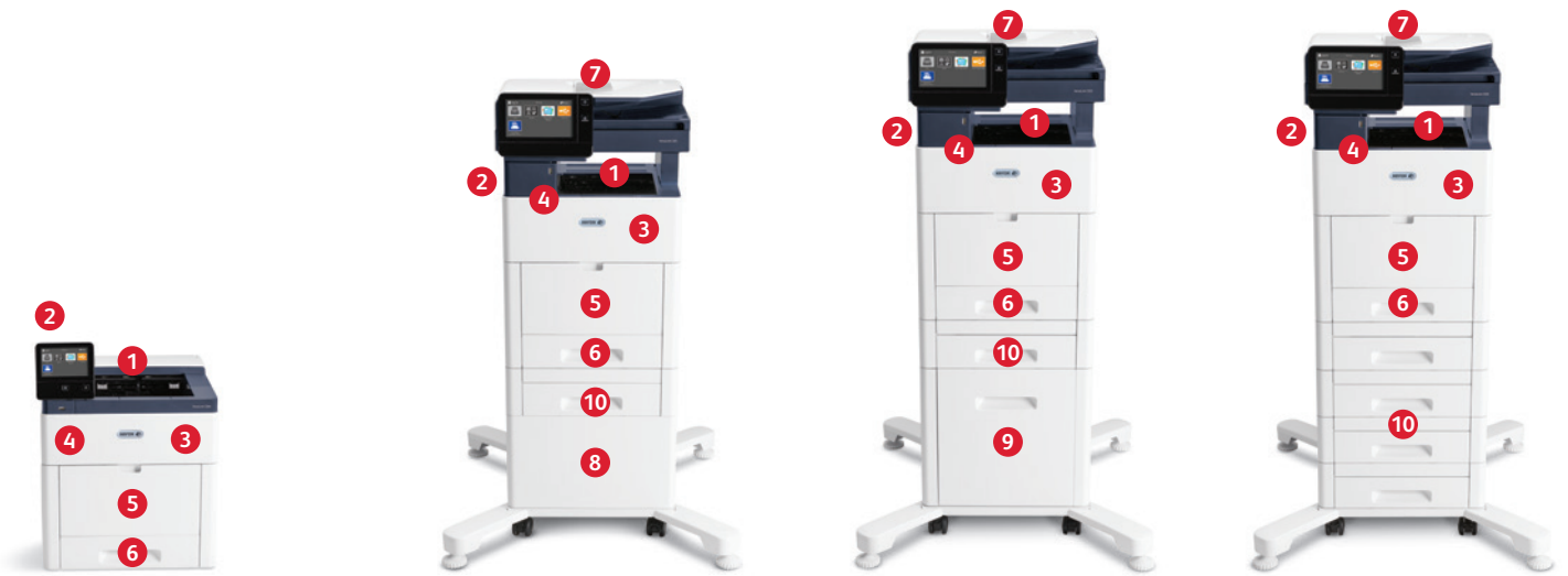
Xerox® VersaLink C500 Colour Printer Print.