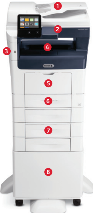
Xerox® VersaLink® B405 Multifunction Printer Print. Copy. Scan. Fax. Email.