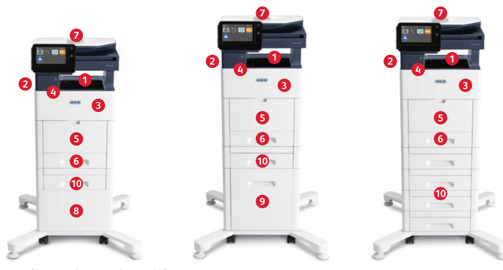
Xerox<sup>®</sup> VersaLink C500 Colour Printer Print.